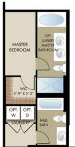
Opt. Luxury Master Bathroom