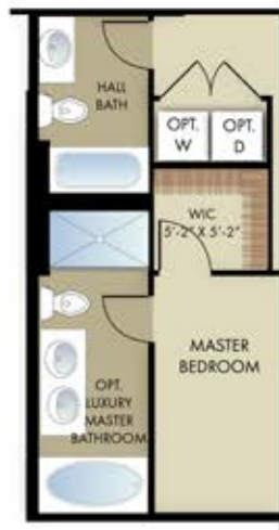
Opt. Luxury Master Bathroom