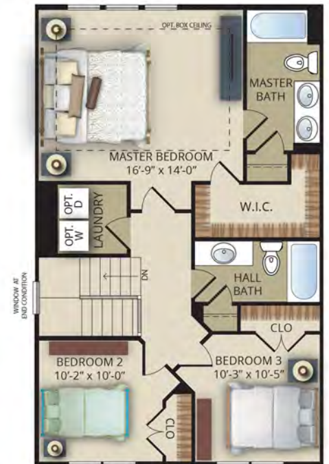
Opt. Luxury Master Bathroom